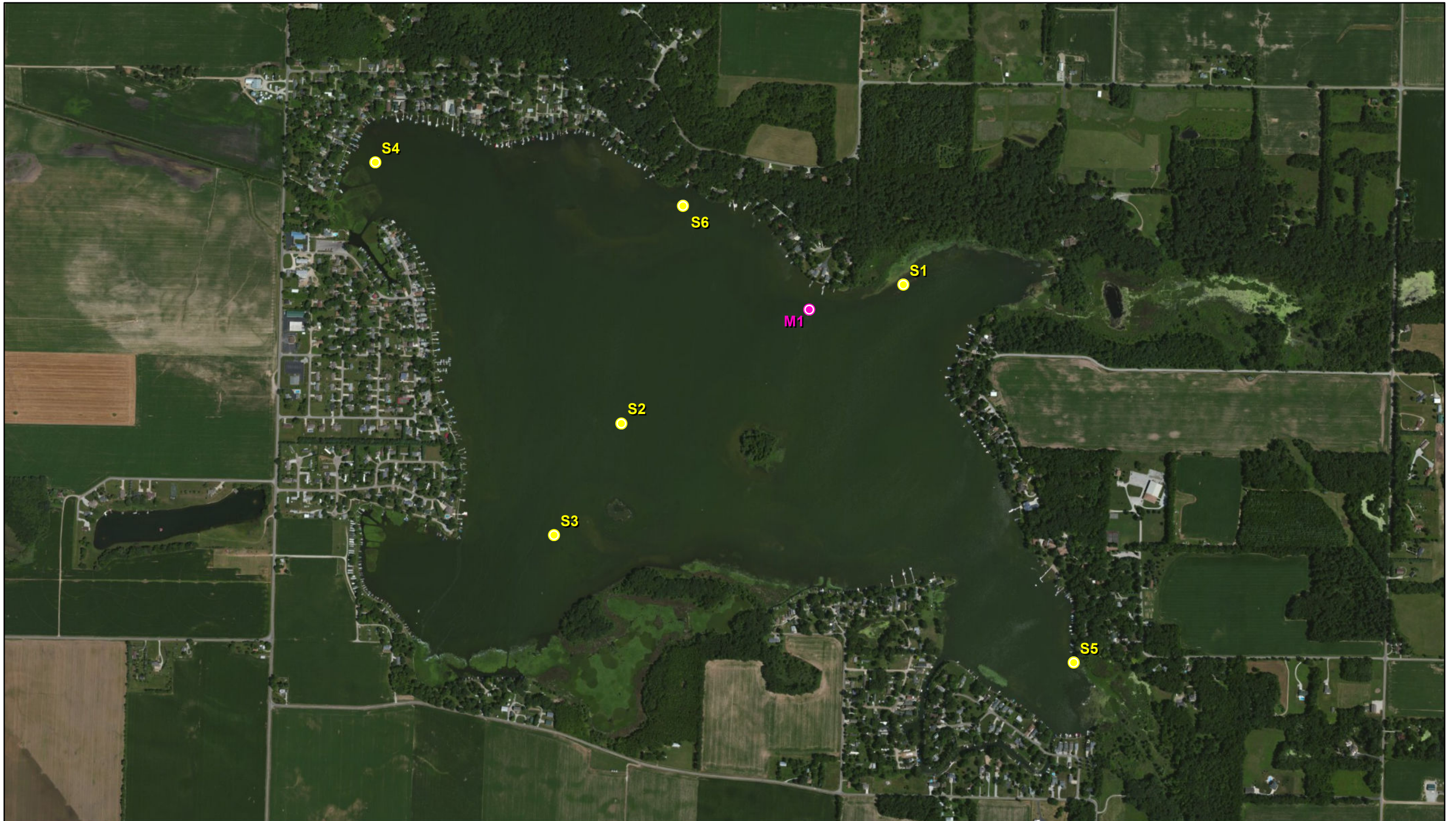
Figure 1. Dewart Lake Kosciusko County, Indiana